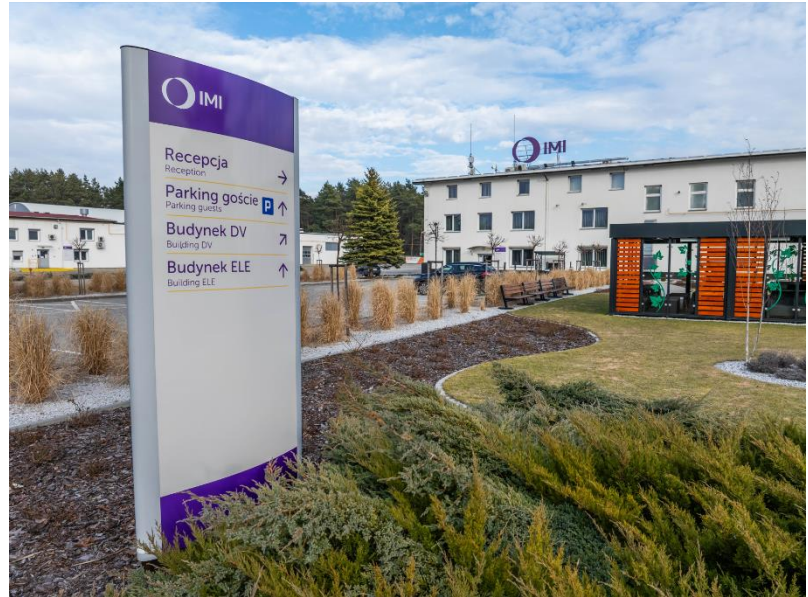
Figure 1 The view of IMI International Sp. z o.o. manufacturing plant located in Olkusz

Climate Control is leading HVAC solutions provider, with manufacturing sites located across the globe. Company is provider of technologies that deliver energy efficient water-based heating and cooling systems for the residential and commercial building sectors. Throughout the history, company have been at the forefront of HVAC industry innovation. The portfolio of brands has what is needed – a complete range of unique, industry-leading products and services. IMI Climate Control is a part of IMI PLC Group, listed on the London Stock Exchange on FTSE 100 list.